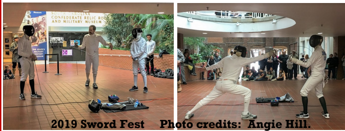
2019 Sword Fest

Please contact Jane if you would like to participate.