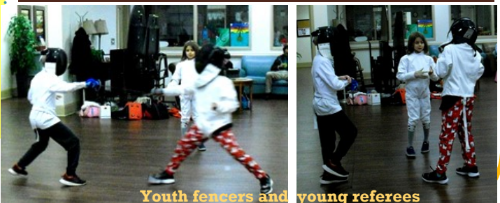
Youth fencers and young referees