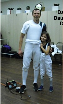
Dad & Daughter Duo