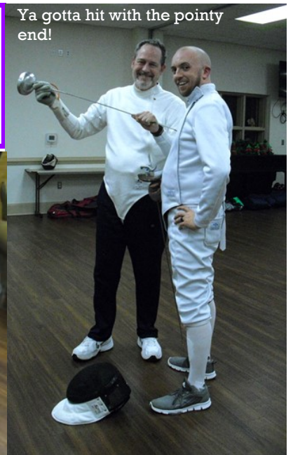
Ya gotta hit with the pointy end!