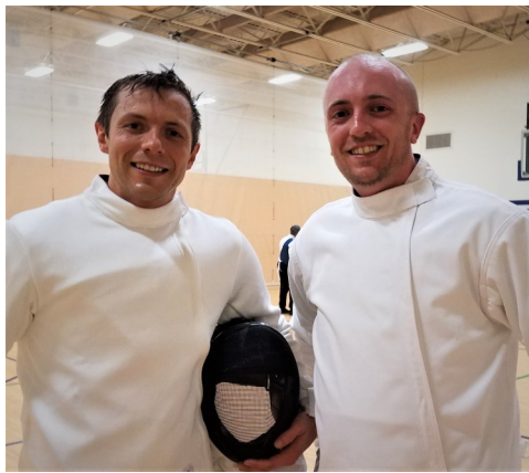
Intro/Overview for new fencers!