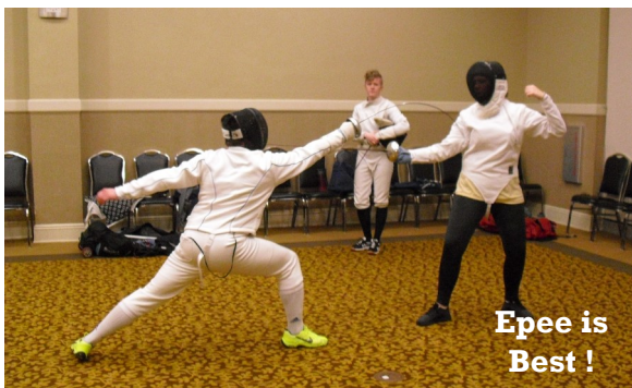
Epee is Best !