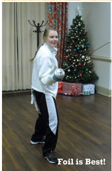
Foil is Best!