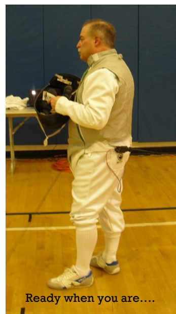
Ready when you are....