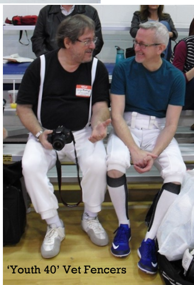
'Youth 40' Vet Fencers