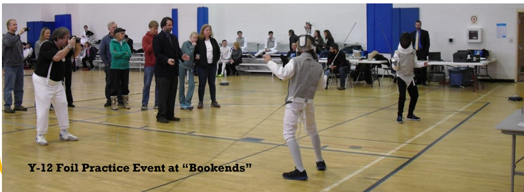
Y-12 Foil Practice Event at "Bookends"