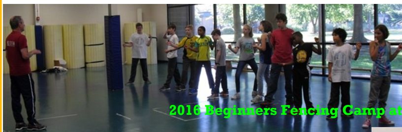
2016 Beginners Fencing Camp at Heathwood Hall