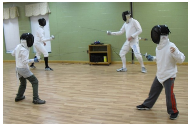
CFC Fencers putting their skills into action!