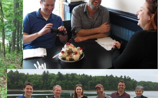
CFC Competitive Fencers convene at Walden Pond after 20 years to reminisce, contemplate where they are now, and celebrate good times!

FOR OUR COMPETITIVE (and soon-to-be competitive) MEMBERS: